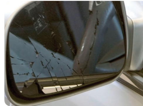
9. Broken Mirror