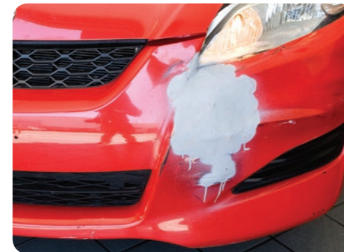
8. Poor Repair