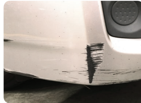
6. Scratched Bumper