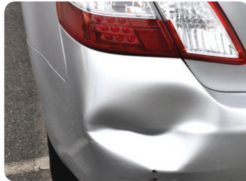
5. Dented Bumper