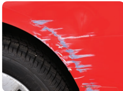
7. Scratched Panel